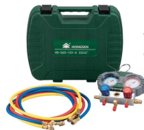
Tool kit High-end plastic-case packaging Convenient storage, easy carry