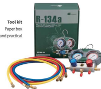
Tool kit Paper box economical and practical